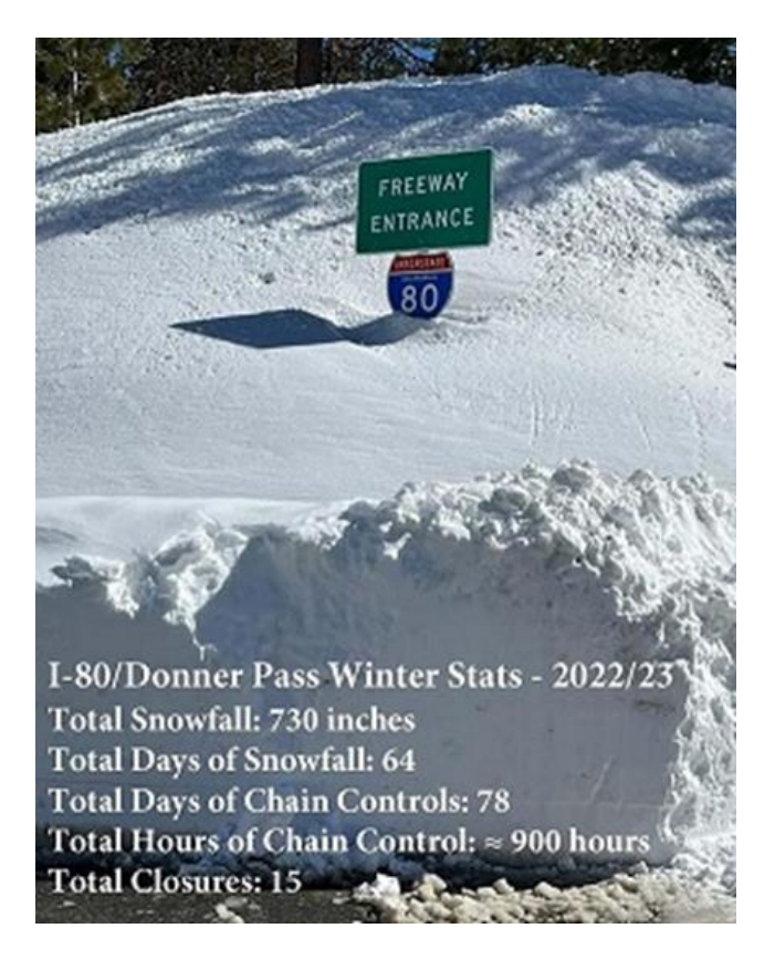
Three District 3 retirees have passed since our

The picture below is a picture and stats of what our snow was like here in District 3.